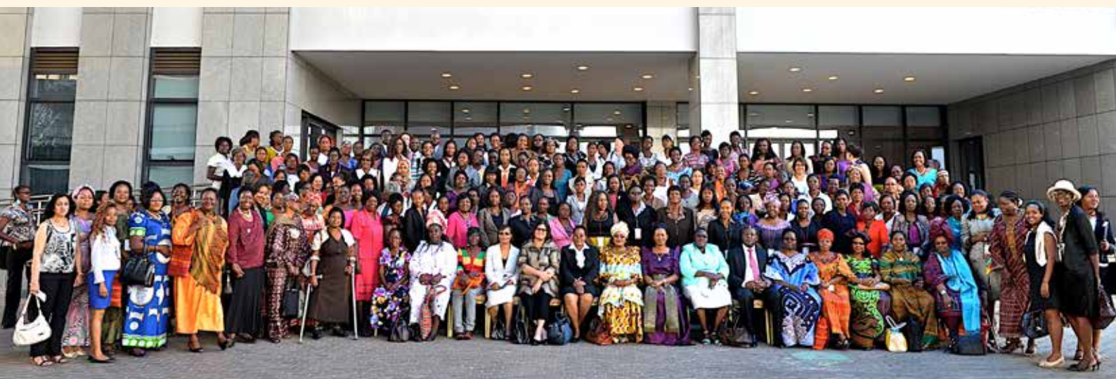
Women Steering Innovative Leadership in Africa, Malawi Conference, 2013