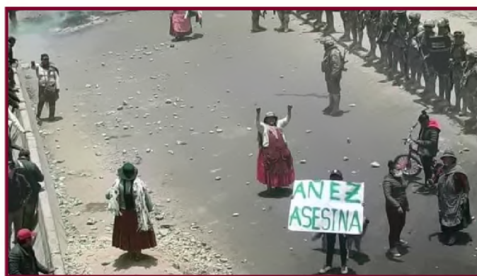
Protestors in front of Senkata plant shortly before soldiers began shooting at them on November 19, 2019. One marcher is holding a sign that reads, "¿Ñez murderer."

Protestors and bystanders outside the plant also reported seeing soldiers drag at least one wounded or dead person into the plant in the afternoon, after the initial teargassing from around 9:00 a.m. to 11:00 a.m. 182 Witnesses stated that people were worried that soldiers would disappear the bodies of the