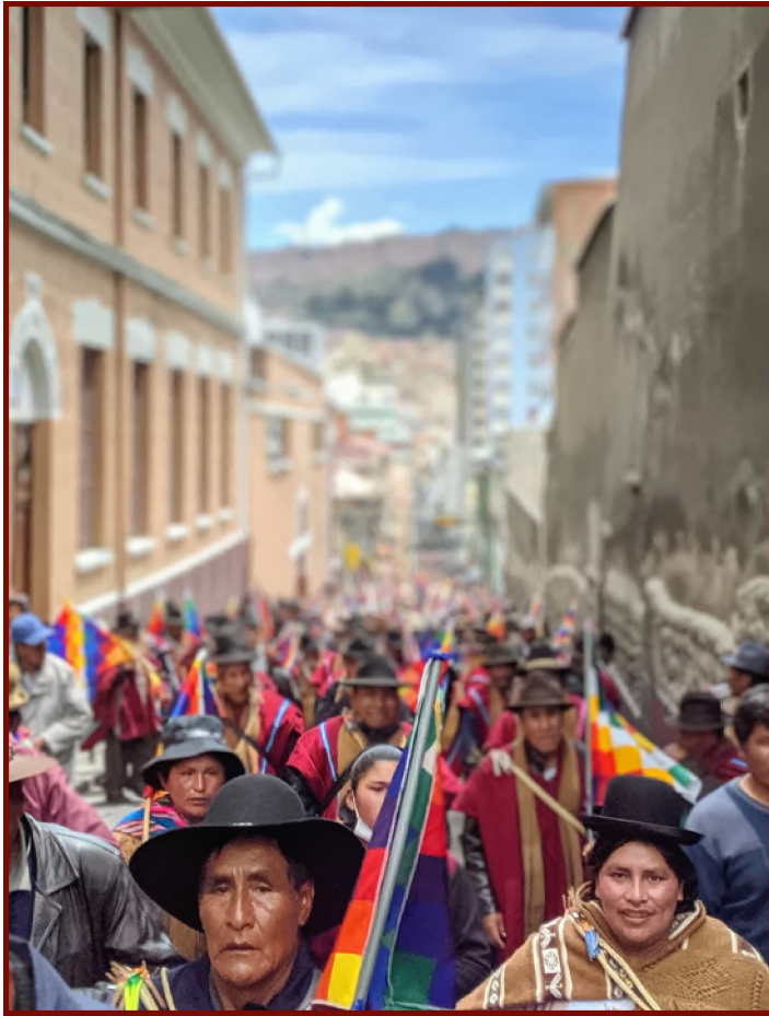
Indigenous groups march after Jeanine Áñez assumes power.