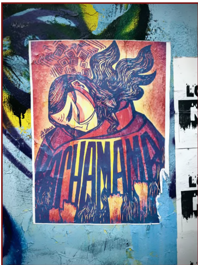
Poster on a wall in La Paz of Pachamama , the mother earth spirit celebrated by indigenous communities in the Andes. Interim President Áñez, a devout Christian, referred to indigenous customs as “satanic” in a tweet.

MAS party members by civilians and para-state groups associated with the Áñez government. The IACHR reports that pictures of MAS officials have been circulated on social media with “wanted” signs pasted below, threats that were often precursors to arrests of or violence against these officials. 430 Further, the IACHR notes reports from the country’s mayoral association that 65 local authorities resigned from their offices “as part of the pattern of pressure and intimidation that is affecting daily life throughout the country.” 431