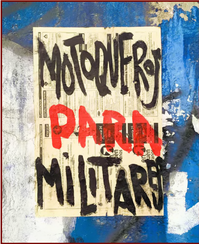
Graffiti denouncing motoqueros as a para-state group in Sacaba.

toqueros reportedly forced MAS supporters to “kneel and ask for forgiveness.” 488 Many of the demonstrators interviewed by the IHRC in Sacaba stated that they participated in the march that day because they were protesting the motoquero beatings and denigration of indigenous women in Cochabamba. 489 One woman recounted how the motoqueros beat and broke the nose of a man for carrying a wiphala . 490