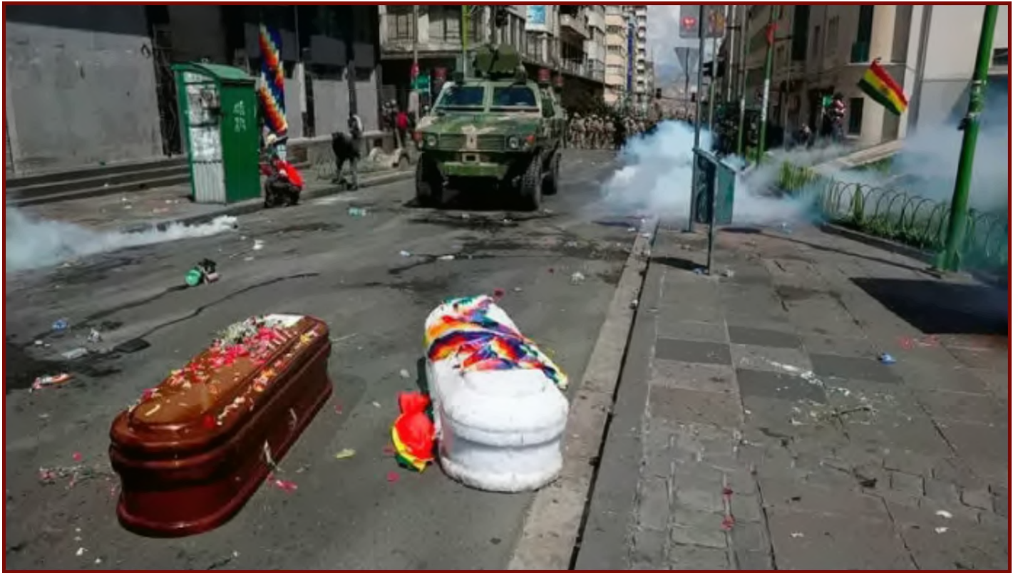
Caskets on the street in La Paz shortly after the military attacked a funeral procession for the victims of Senkata.