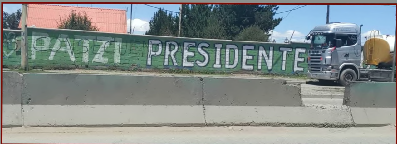
Both sides of the same section of the median outside the Senkata plant. In the top photo, the circles indicate bullet holes facing the plant where the soldiers were principally located. In the bottom photo, the side of the median with no bullet holes faces where civilians were principally located.