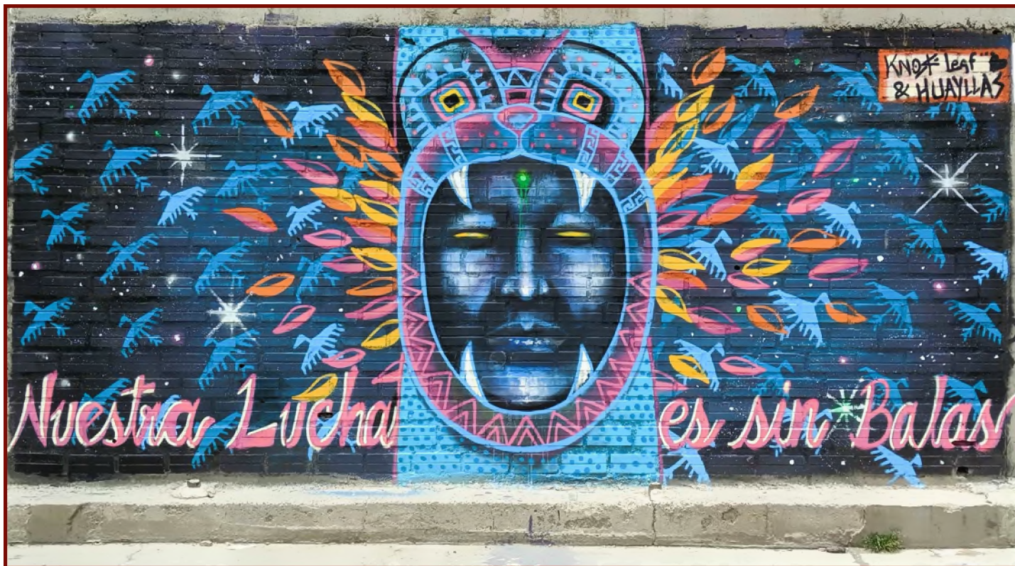
“Our struggle is without bullets,” reads a mural outside of San Francisco de Asís Parish, where the wake of the Senkata victims was held. In March, police gassed this location during a meeting of community members.

with soldiers, who positioned themselves inside the Senkata plant. 154 On November 19, between 9:00 a.m. and 11:00 a.m., security forces suddenly and indiscriminately fired tear gas at the demonstration outside the plant. 155 According to eyewitnesses, soldiers aimed the gas at hundreds of demonstrators gathered in the streets and also into nearby houses where children were present. 156 Individuals inside their homes, who were not taking part in the demonstrations outside, were surprised and unprotected, so they broke the windows of their homes and poured out into the streets to escape the gas that suffocated them. 157 One passerby described seeing “grandmothers and children running from their houses.... It was horrible.” 158