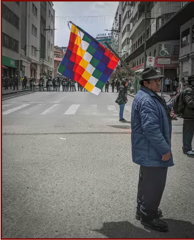
Indigenous man with wiphala in front of a line of security forces.