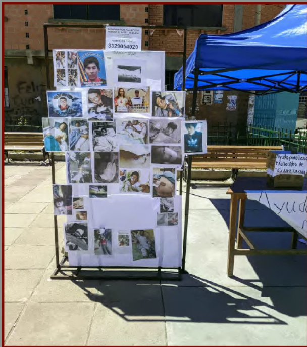
Fundraiser for Senkata Victims.