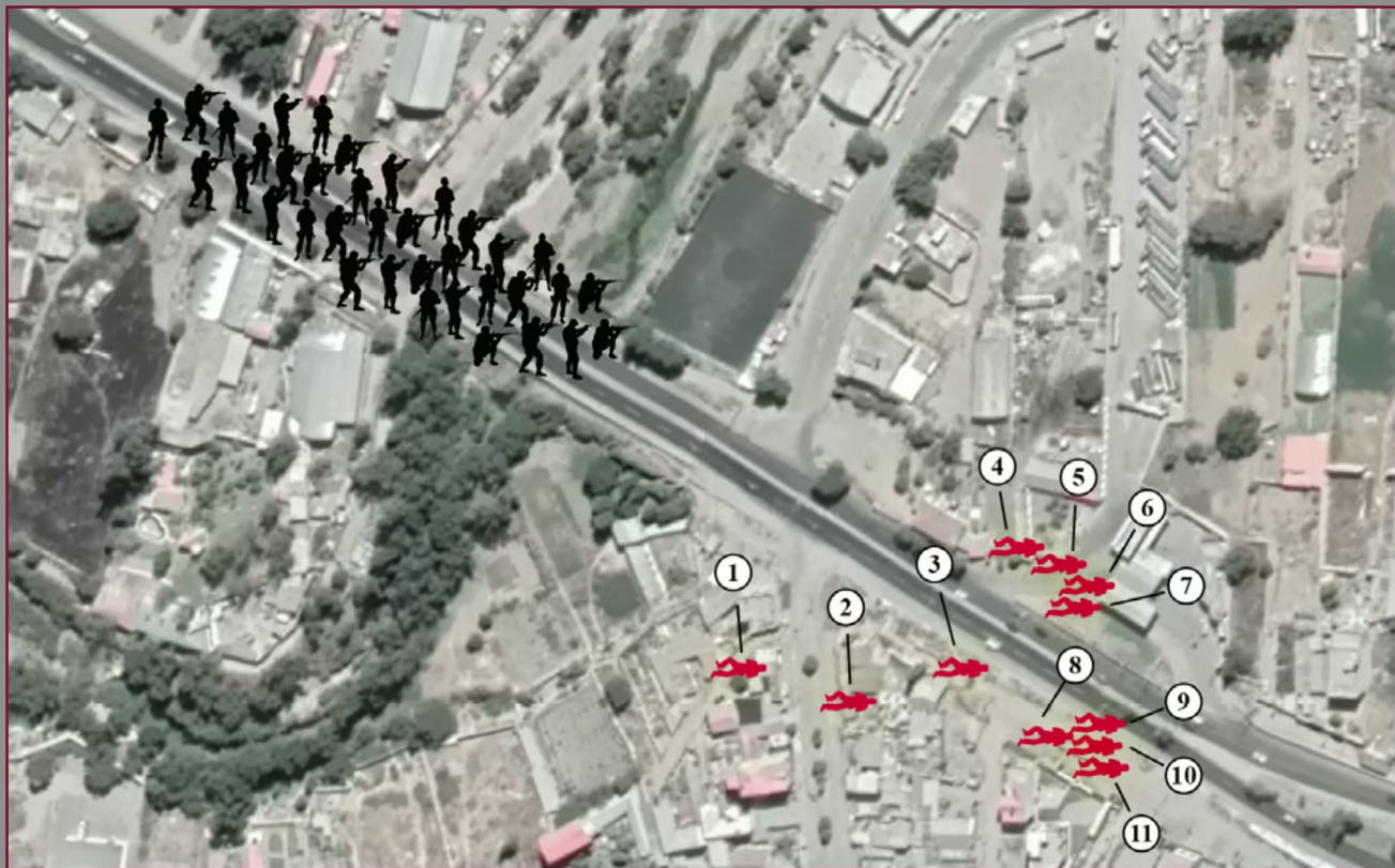
Map of Sacaba on November 15, 2019. The location of the casualties in red are based on GPS coordinates taken by the IHRC. The location of the soldiers in black are based on videos, photos, and testimonies of protestors, bystanders, and government officials. ©2020 Thomas Becker