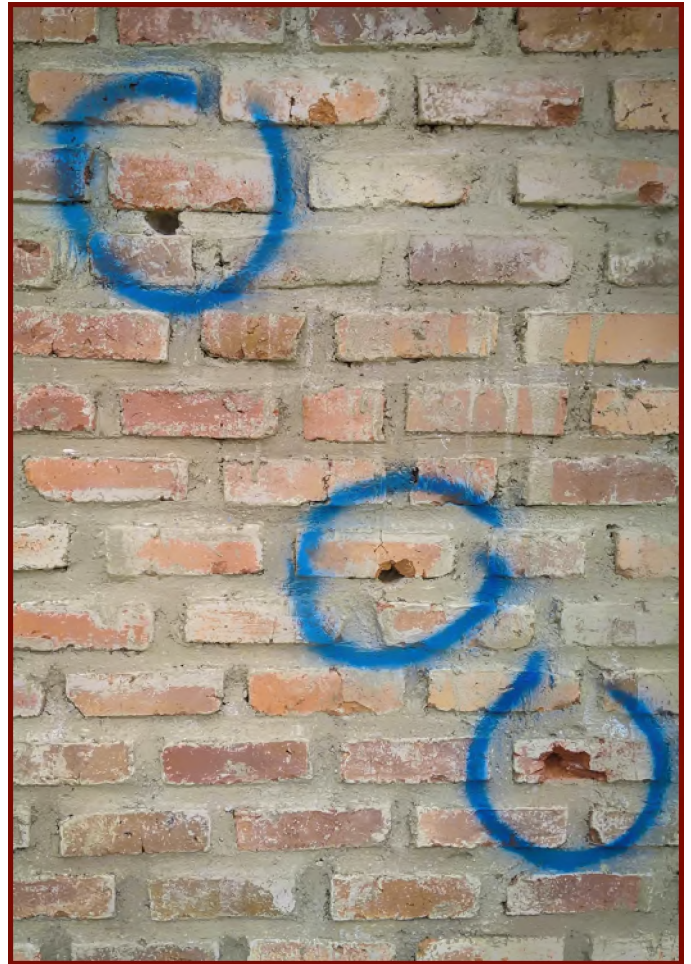
Bullet holes on the wall of a house in Sacaba. The wall faces the Huayllani bridge, where soldiers were stationed on November 15, 2019.