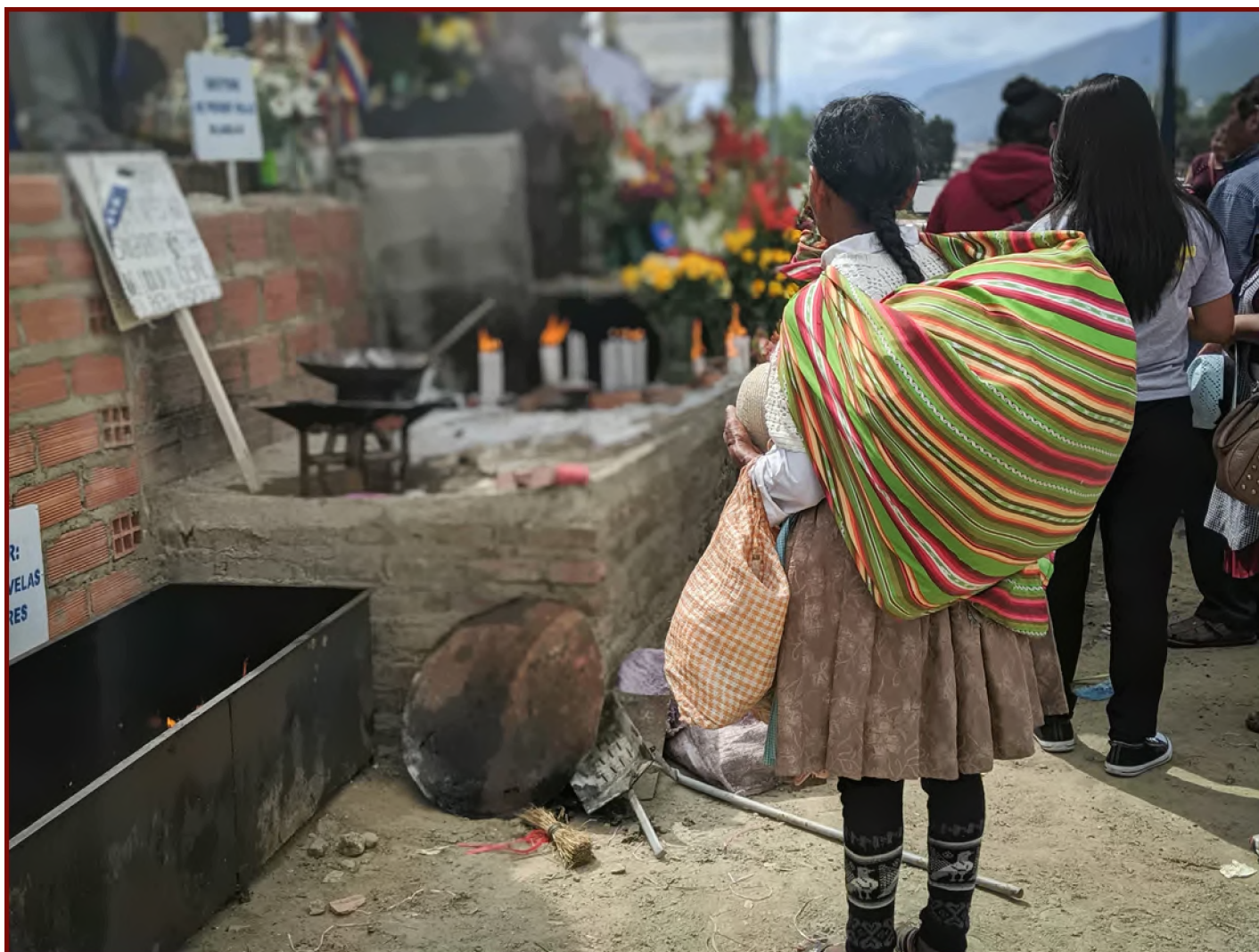
Quechua woman paying her respects at the community memorial for those killed in Sacaba.

ber 19 in Senkata—Bolivian security forces used lethal force against protestors and other civilians that resulted in significant loss of life and injuries. The IHRC collected direct eyewitness testimony, videos, and photos of the attacks that demonstrate widespread human rights abuses by the state. Specifically, the Clinic found credible evidence that: (1) state forces engaged in disproportionate use of force, using live rounds against civilian protestors; (2) military and police used racist and anti-indigenous language during violent encounters with civilians; and (3) authorities created an atmosphere