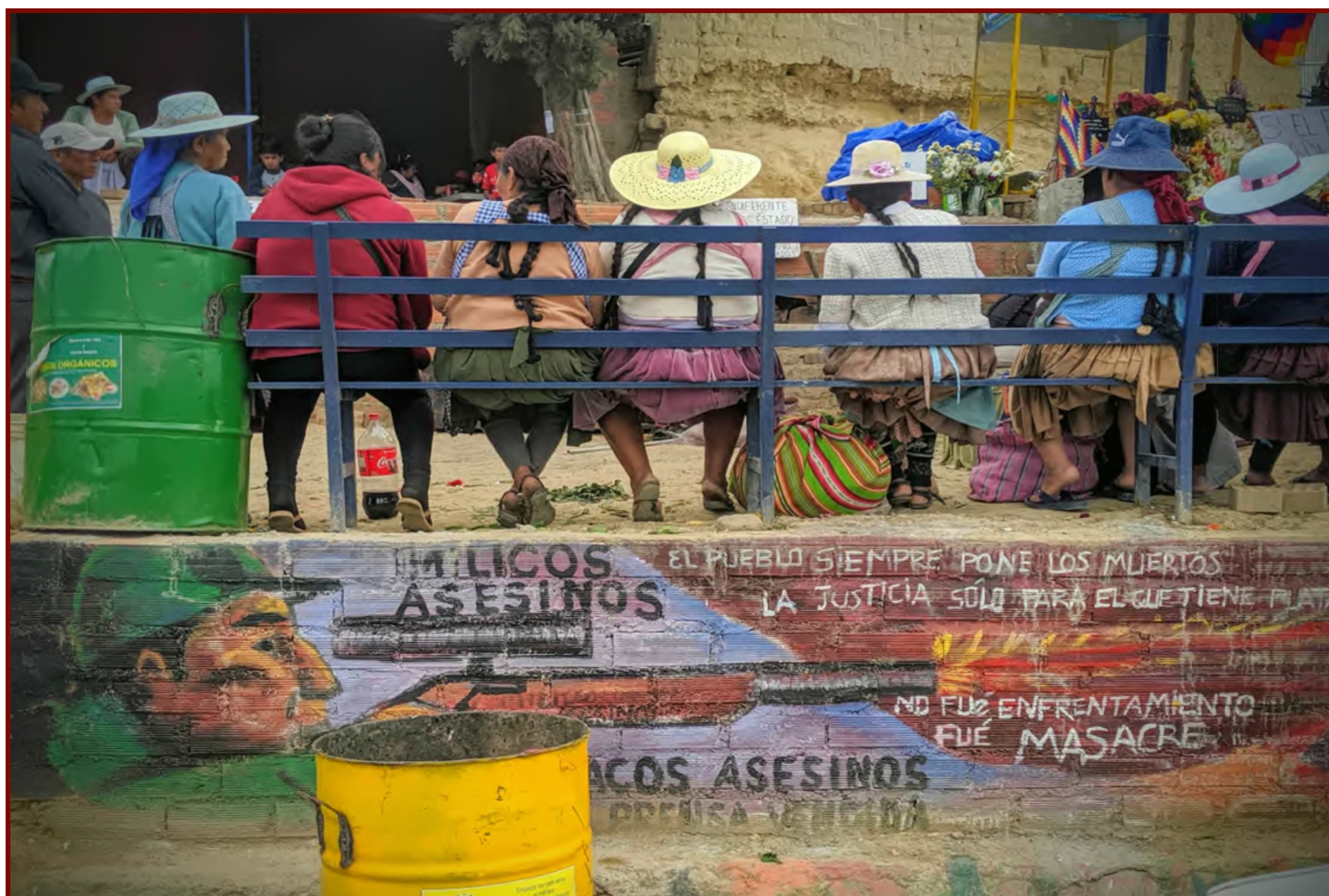
Women in Sacaba sitting above a mural stating, “Death is always for the people. Justice is only for those with money.”

Numerous obstacles stand in the way of an impartial and comprehensive investigation of the violence that took place in Sacaba and Senkata. Since the November killings, the IHRC team has documented instances of evidence tampering; autopsy irregularities; overworked and under resourced prosecutors; failure of security forces to comply with lawful requests for information; and witness intimidation. These impediments are significant and facilitate