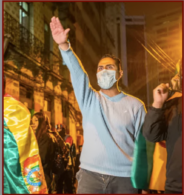
Anti-Morales protestor at a march in November 2019 giving the Nazi salute. Though most anti-Morales protestors did not act this way during the 2019 demonstrations, there has been an upsurge in racism since the 2019 elections.

The widespread anti-indigenous backlash in Bolivia raises concerns that Bolivia is returning to the days when indigenous people were treated as second class citizens. One indigenous man recounted a recent scene that was reminiscent of the days of the dictatorships: “We saw them step over the wiphala and kick women in polleras . Most of