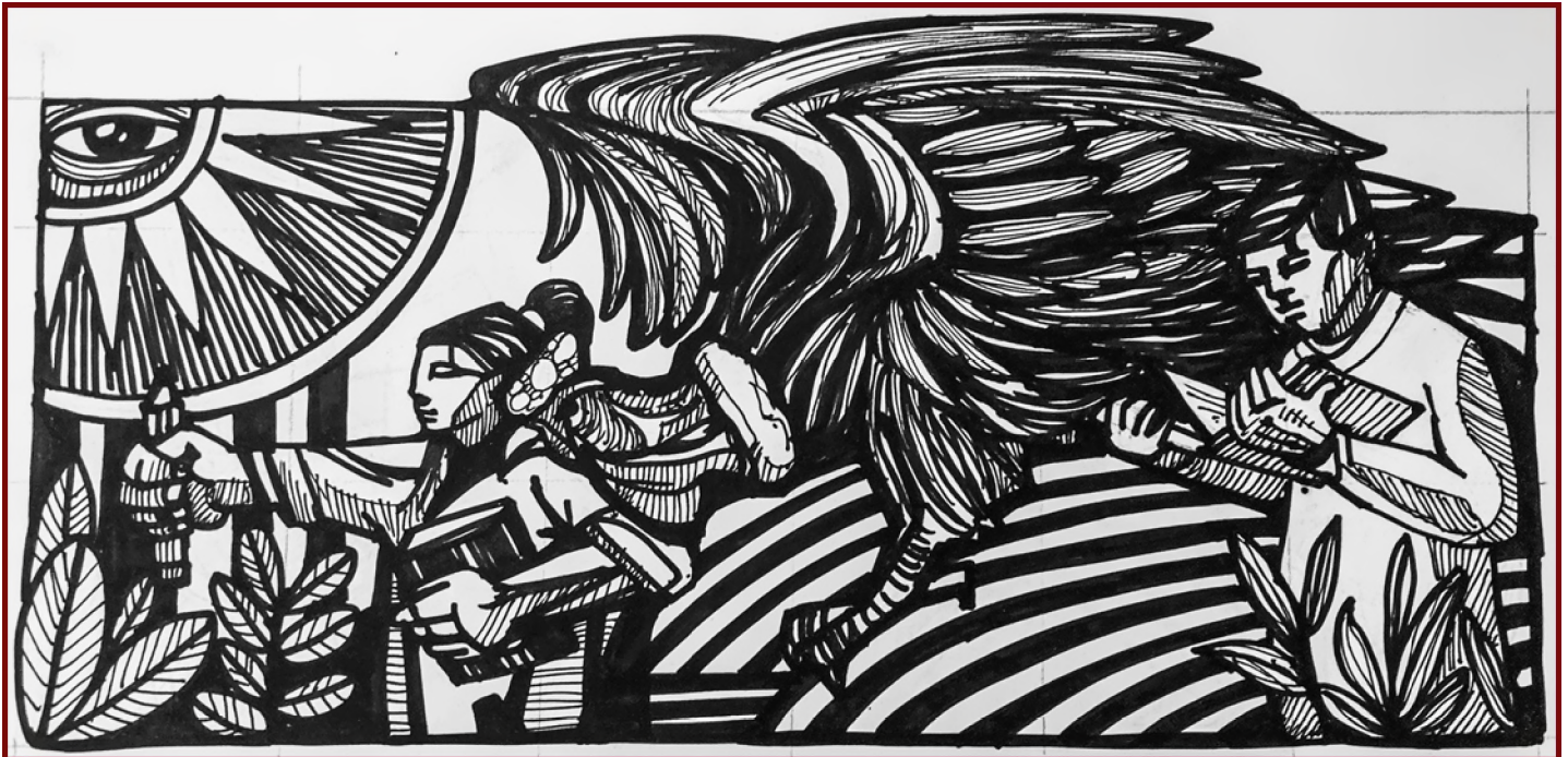
Mural sketch in Leonel Jurado Pajsi’s notebook that police confiscated for “seditious” activity.

Civilian groups have also harassed members of the IHRC team. On seven separate occasions in December 2019 and January 2020, civilian groups surrounded the team, yelling things such as, “He is with human rights – he’s seditious,” “Where’s your friend Evo,” and “Foreigners out of the country.”