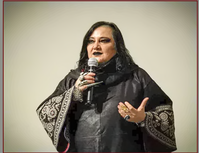
Writer and activist Maria Galindo gives lectures at universities around the world on issues such as feminism, indigenous rights, and social movements.

Página SIETE originally pulled the piece but eventually published it accompanied by an editorial note dismissing its contents for lack