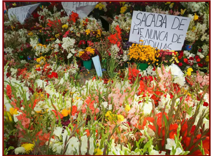
Flowers left for the victims in Sacaba. Indigenous communities frequently use the phrase “...de pie, nunca de rodillas” (standing, never on our knees) in response to repressive governments.

While the UDHR and ICCPR are applicable globally, regionally, in Latin America, the most important human rights treaty is the American