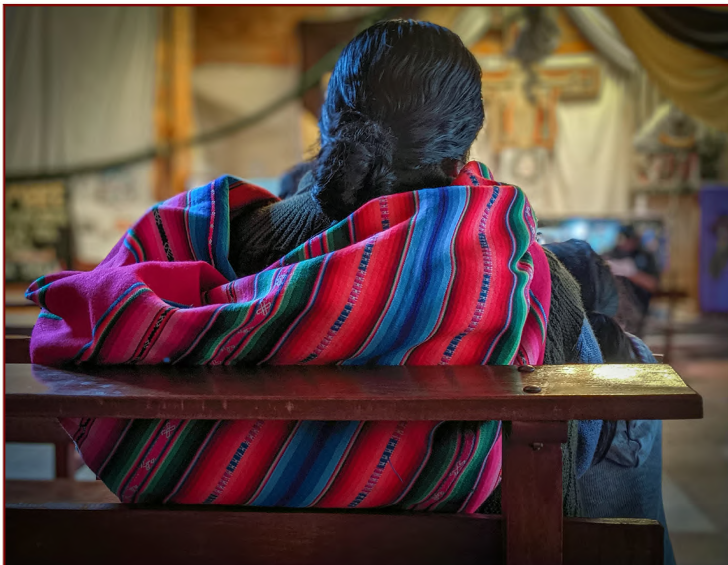
Mother at San Francisco de Asis Parish. The parish was turned into a makeshift morgue following the Senkata killings.

to provide testimony that day expressed that they were frightened to tell their stories because of the presence of hostile, heavily-armed police, many of whom were the same officers involved in the crackdown on November 15. The Director of Andean Information Network, which works on human rights issues in Bolivia, noted, “The aggressive, abrasive attitude of the police officers and their treatment of human rights observers was problematic considering those same forces played a key role in the massacre just months before, creating a difficult situation for families and witnesses who could