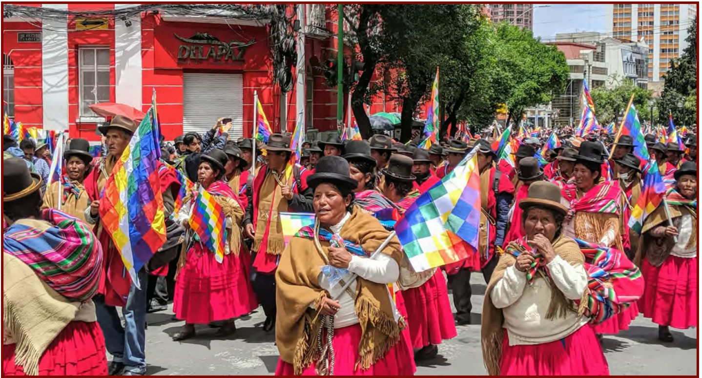
Indigenous communities, led by indigenous women, march on November 15, 2019 in response to the recent anti-indigenous attacks in Bolivia.

In 2006, Bolivians elected the country's first indigenous president, Evo Morales of the Movement for Socialism (MAS) party. Many saw Morales' election as a victory for indigenous rights and racial equality. 2 His government created a new constitution that codified comprehensive rights for indigenous communities and traditionally marginalized groups. 3 Women and indigenous Bolivians began to occupy positions of power in the government in unprecedented numbers 4 and poverty declined dramatically. 5