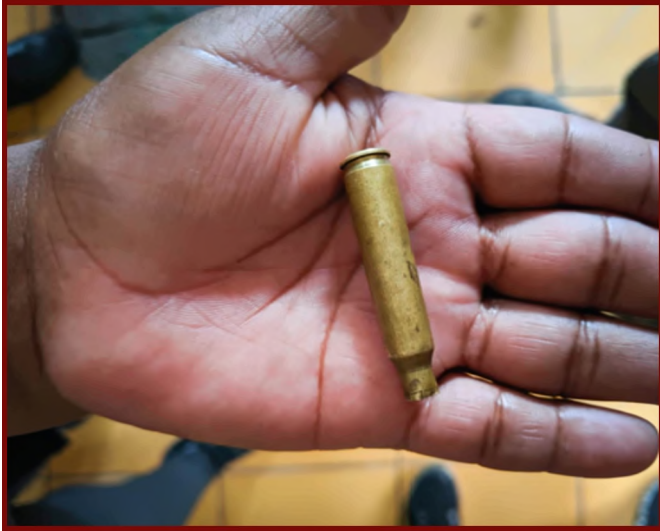
Bullet casing found in Sacaba.

and accurate investigation into the killings of their loved ones. 236