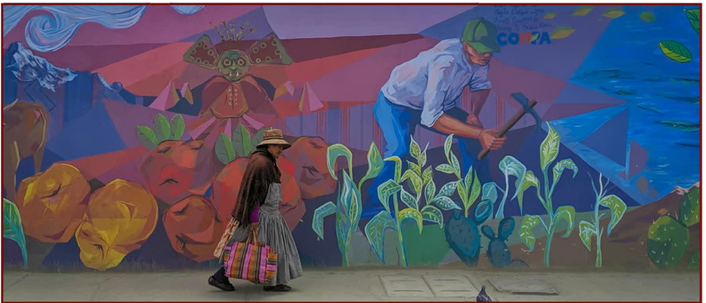
Señora de pollera walking in El Alto. Indigenous women have increasingly been the targets of racist attacks since the October 2019 elections.

According to the Mexican government, their embassy in La Paz has been surrounded by police officers in what Mexico calls a "siege" that is "clearly meant to intimidate" those within the embassy. 378 Mexico maintains that Bolivian police have harassed diplomats due to the presence of the asylees within the embassy, and Mexico has announced its