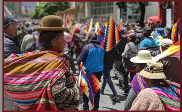
Aymara woman in La Paz.

Other instances of SGBV have been committed by para-state actors or civilians acting under state-sanctioned impunity. During a vigil at Cochabamba's City Hall, a group of women were