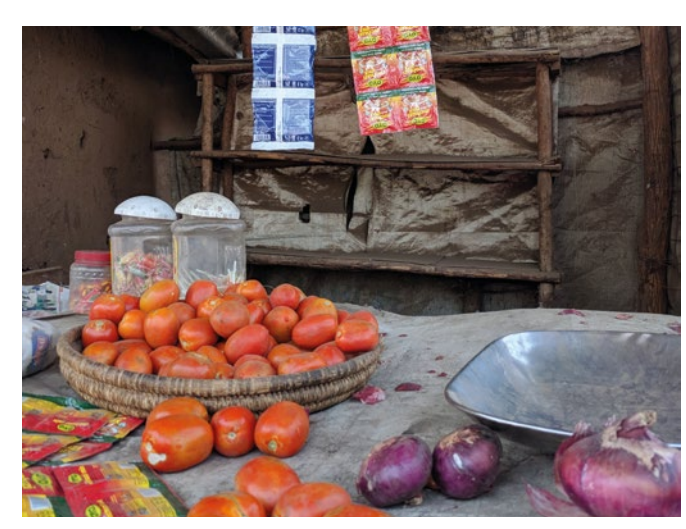
Shop in Kakuma I, January 2018.

Kenya is party to a number of treaties relevant to the right to work, in particular: the 1951 Convention Relating to the Status of Refugees and its 1967 Protocol (the 1951 Refugee Convention); the International Covenant on Economic, Social and Cultural Rights (ICESCR); and the 1986 African Charter on Human and Peoples' Rights (the Banjul Charter).