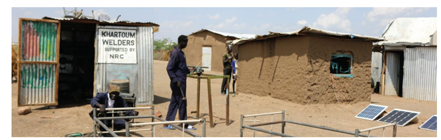
Two refugees at their garage in Kakuma, 2018.

Despite a general awareness of the business permit requirement, some refugees were confused about what the document looked like. A South Sudanese woman running a business in Kalobeyei thought her licences and medical certificate comprised a business