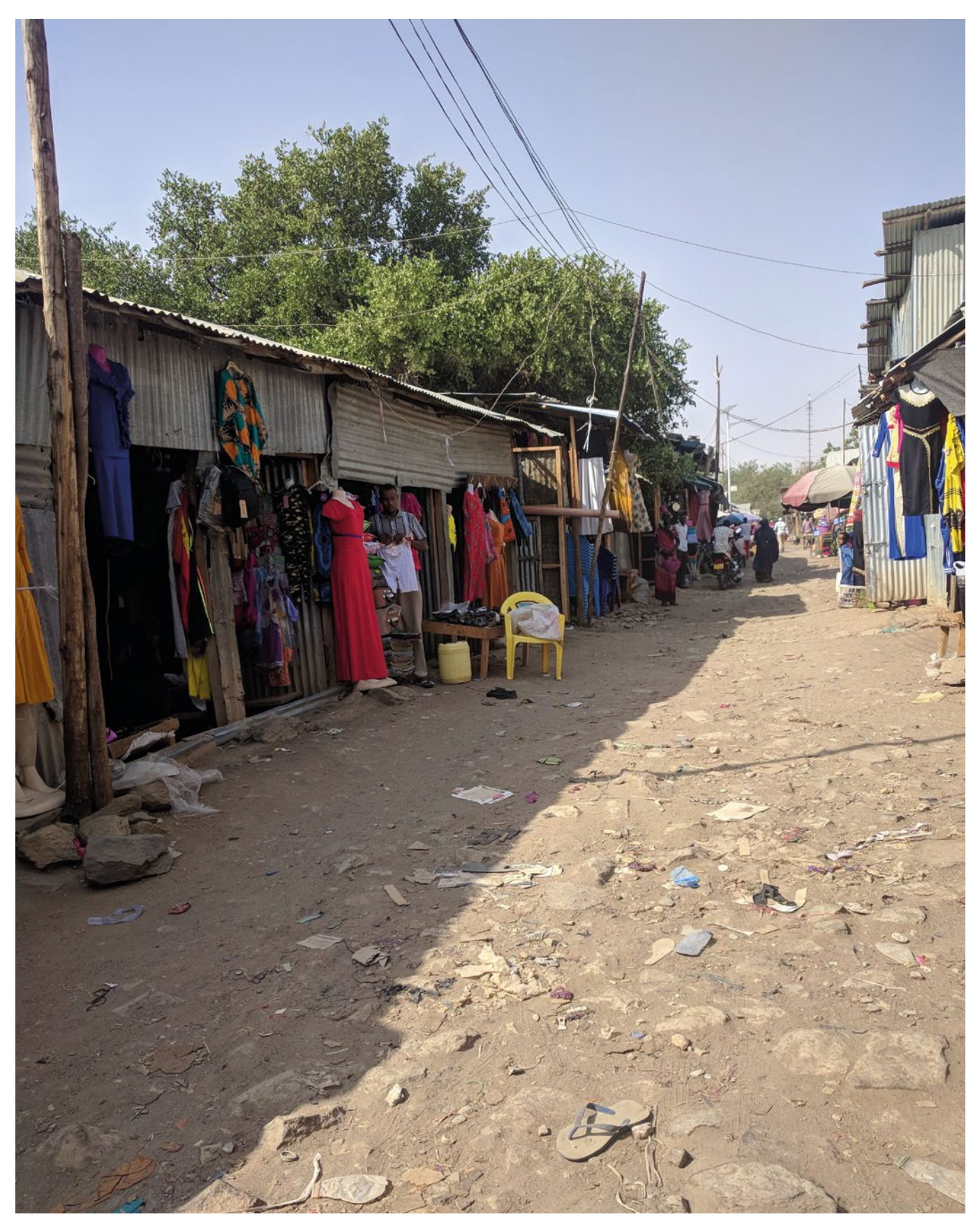
A market in Kakuma I, January 2018. IHRC.