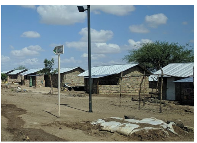
Shelters in Kalobeyei settlement, January 2018. IHRC.

In June 2015, the Turkana County government handed over a 15-square-kilometre site for the creation of a new refugee settlement, intended to decrease overcrowding in Kakuma camp and ensure access to services as well as increase opportunities for self-reliance through a new "settlement" style approach. In 2016, UNHCR began relocating refugees to this new settlement, Kalobeyei, located about 25 kilometres northwest of Kakuma town. As of July 2018, of the 38,300 refugees living in Kalobeyei, more than 73 per cent are from South Sudan, 12 per cent from Ethiopia,