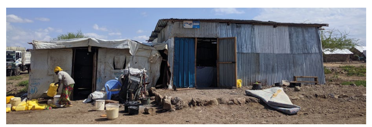
A WFP-accredited shop in Kalobeyei. November 2017. IHRC.

Refugee business owners emphasised that holding a business permit was important because it showed they were complying with the law. In NRC's survey, 37 per cent of business owners considered "compliance with the law" to be an important reason to hold a business permit. In interviews, a 33-year-old Somali refugee with a clothing shop said that having a business permit was "very important because it is the rule of the government" and "[y]ou have to follow the rule of the government." Complying with the law was also a source of pride for refugees. A 24-year-old Congolese man who had lived in Kakuma since 2012 put it this way: "I personally think it's important to start a business legally - to be known by the government - to identify you legally." He stressed that "you will be proud to show [your business permit] . . . [b]ecause you know you started that business legally - you'll have that pride." Similarly, in NRC's survey, a fifth of business owners considered that having a business permit meant customers would trust them more.