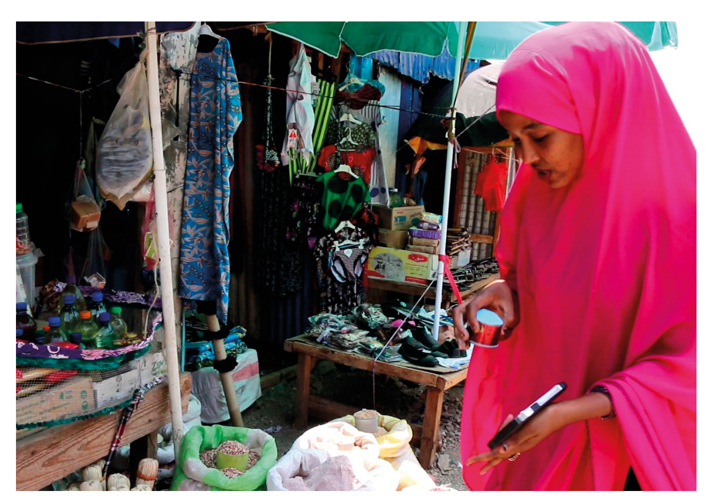
A Somali refugee shopping in one of Kakuma's markets, 2018.

Many refugees with businesses said that the fees for business permits were too high, especially when they had to also obtain a licence and/or undergo a medical examination. In NRC's survey, nearly a third (32 per cent) of business owners with permits said they had to obtain these additional documents to receive a business permit. In interviews, refugees reported paying fees ranging from 500 KSH ($5 USD) to 6,200 KSH ($62 USD) for a single business permit, significant sums of money in the context of Kakuma. In NRC's survey, only around a fifth (19 per cent) of respondents indicated that they earned an income from working in Kakuma: just over half (51 per cent) earned less than 5,000 ($50 USD) KSH a month, and a further 44 per cent earned between 5,000 and 10,000 KSH ($100 KSH) a month. The median amount surveyed business owners reported