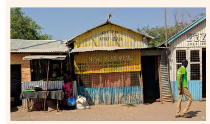
Shop in Kakuma I market, January 2018.

Several refugees said they would have liked to receive financial support to be able to engage in business and earn a living through it. A 24-year-old Burundian mother with a young child said that if she received financial support she "would be the most happiest woman" because with the money "we [a group of women] could start a business of our own." Some refugees suggested that since starting a business can require substantial resources, UNHCR and NGOs could go beyond employing the refugee community as "incentive workers" and directly provide loans for refugees to start businesses. A pilot programme, run by a consortium of NGOs operating in Kakuma called SPARK, began in 2017 with this goal in mind. While this consortium ended in 2018, the need for strategic livelihoods programming to support business incubation and access to credit and loans - as well as help for refugees to formalise their businesses - remains key in Kakuma.