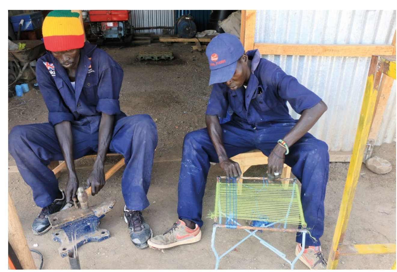
Two South Sudaneses refugees in their fabrication shop in Kakuma, 2018.

Support the Government of Kenya, Turkana County government, RAS, UNHCR, and NGOs to carry out the above recommendations.