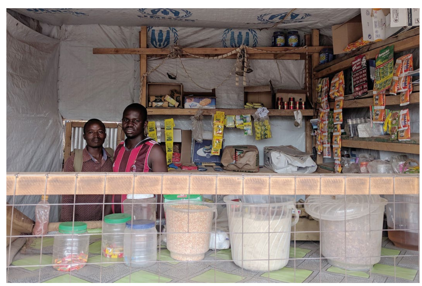
Shop in Kakuma II, January 2018.

In Turkana County, county law mandates that anyone running a business must have a permit for that business and renew that permit annually.<sup>20</sup> Fees for permits depend on the type of business and where in the county it operates: businesses in poorer parts of the county pay lower fees. Although every business must have a business permit, whether the business needs additional licences depends on the type of business. For instance, refugees handling food must obtain (and pay a fee for) a Food, Drug, and Chemical Substances Licence, and refugees selling alcoholic drinks, an Alcoholic Drink Licence. Licences must be renewed annually. Refugees with shops that handle food and beverages must also pay for and undergo