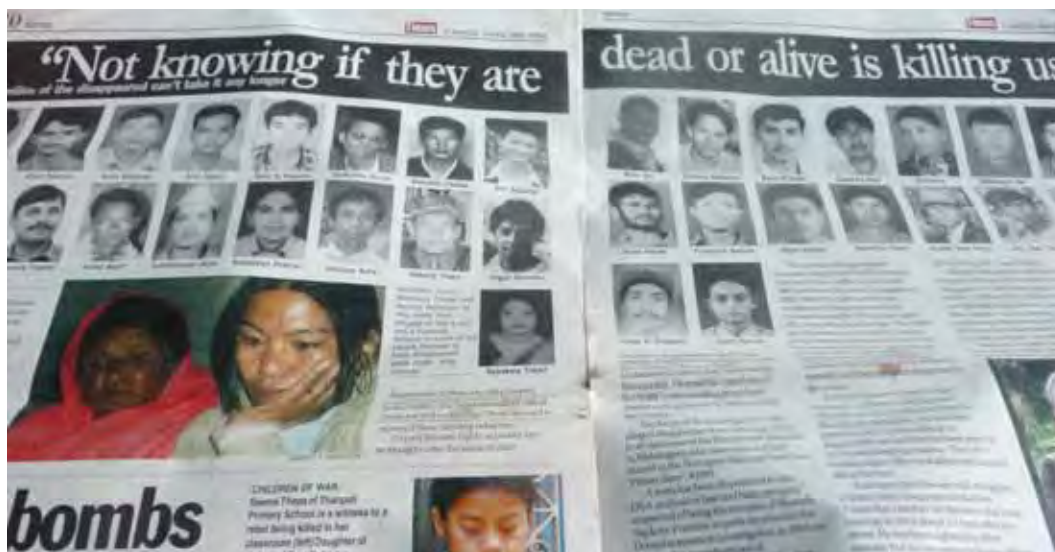
Civilian victims need to know the truth about what happened to them or their family members, as indicated by this Nepali Times headline. A new truth, reconciliation, and disappearances commission could help provide that information, but only if there is political will to back its work.

The Commission Ordinance makes some provision for the finding of truth related to both individual cases of abuse and the root causes of the conflict. The Commission could help facilitate that process because it would have the option to grant amnesty to perpetrators who “express the details of the truth and facts to the full extent of his/her knowledge.” 359 In addition, the Commission would have investigatory powers similar to a national court, such as the power to subpoena documents and witnesses, to carry out or direct others to perform on-the-ground investigations, and to procure the services of experts. 360 It could summon witnesses and record testimonies, order the submission of documents, and hold witnesses in contempt. 361 It could demand suspension of government officials who were undermining the investigation. 362 It could take measures to protect witnesses and reimburse their