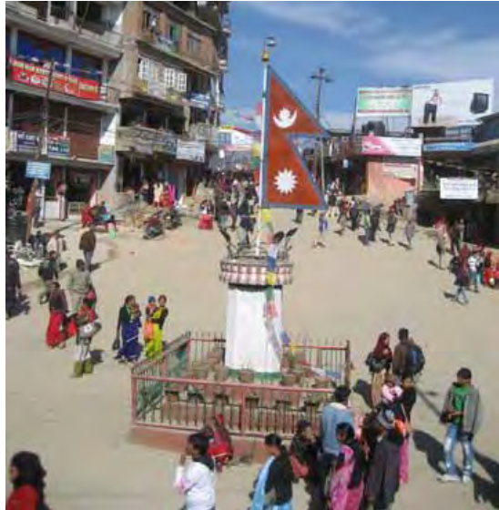
Many victims in rural areas of Nepal have found it difficult to access interim relief. They often lack the means to travel to district capitals, such as Charikot, Dolakha (shown here), to obtain compensation for their injuries.

of and difficulties faced by female victims. The distribution of most interim relief as monetary payments—rather than as in-kind assistance such as the vocational training or scholarships often desired by female recipients—has facilitated abuse of the program by allowing in-laws and other relatives to demand the relief money from the women who received it. In-kind assistance, by contrast, cannot be transferred with the same ease and would be less vulnerable to expropriation. One widow expressed sadness and frustration, having been forced