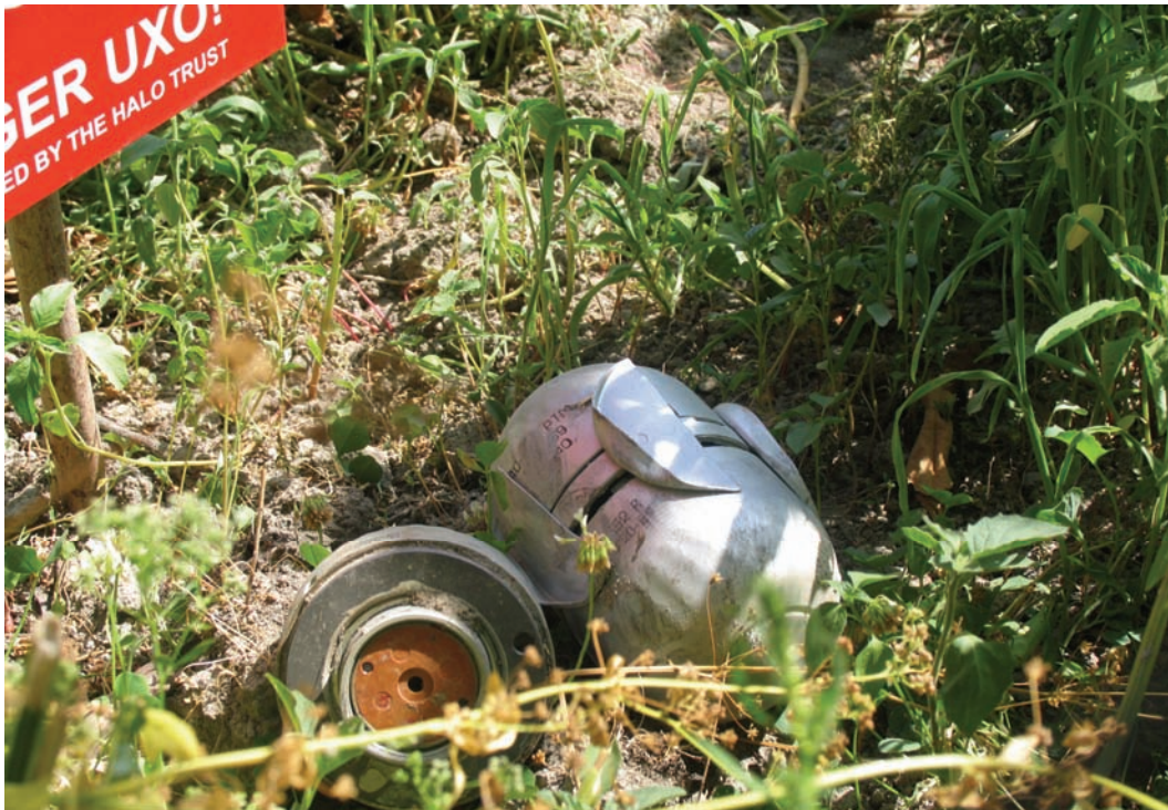
An unexploded Russian AO-2.5 RTM submunition lies near the public square in the center of Variani in August 2008. The submunition, an antipersonnel and anti-materiel weapon, can be carried in RBK-500 and RBK-250 air-dropped cluster munitions.