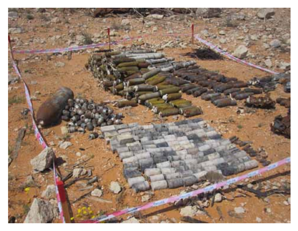
Deminers gathered and marked off these weapons found at the Zintan ASA. Deminers across the country said they often could not destroy the munitions they collected due to a lack of explosives.

A number of factors have contributed to the explosives problem. First, Libya has fewer pre-existing supplies of explosives than initially thought. "The huge stocks of explosives we thought were there probably aren't